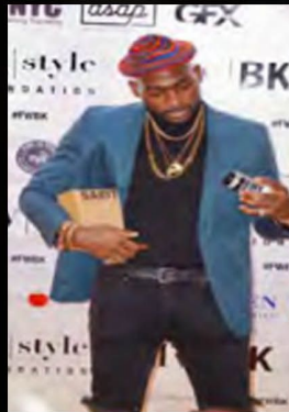
SAINT NEW YORK @saintnewyork