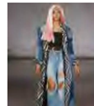
DENIM NIGHT OUT