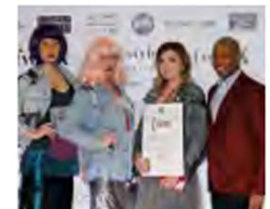
BK STYLE MUSE AWARDS PRESS CONFERENCE