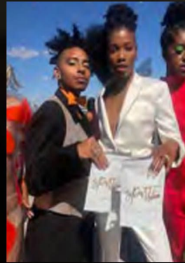
SPARTI SCENTS @spartiscents