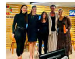
TECH & SUSTAINABILITY