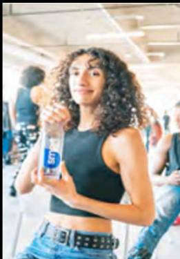
SMART WATER @smartwater

Fashion week Brooklyn is your direct route to engage passionate consumers who make purchases