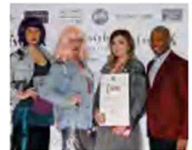
BK STYLE MUSE AWARDS PRESS CONFERENCE