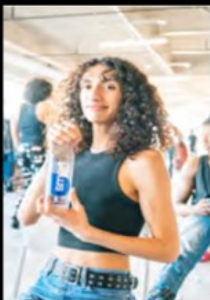
SMART WATER @smartwater