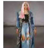
DENIM NIGHT OUT