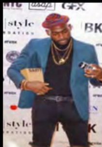
SAINT NEW YORK @saintnewyork