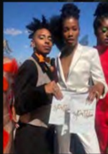
SPARTI SCENTS @spartiscents