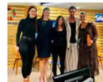
TECH & SUSTAINABILITY