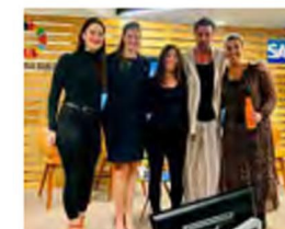
TECH & SUSTAINABILITY