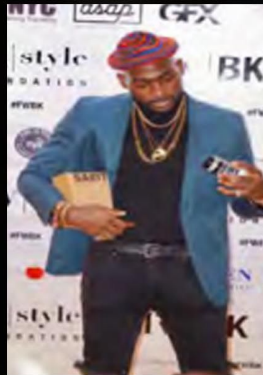
SAINT NEW YORK @saintnewyork