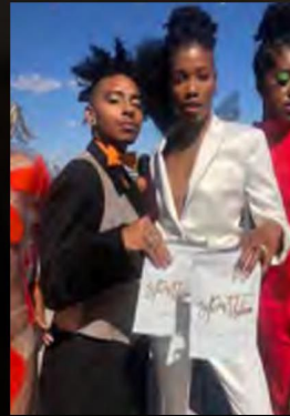
SPARTI SCENTS @spartiscents