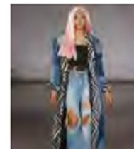
DENIM NIGHT OUT