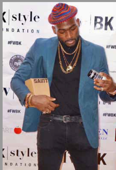
SAINT NEW YORK